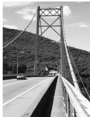
Bear Mountain Bridge

The aqueduct would be designed on the same principal utilized by the Romans thousands of years ago. Water would flow on a downhill gradient so that pumps would never have to be used. Finally, after ten years of building, the tunnel under the Hudson the aqueduct began pumping water to New York City in 1917.